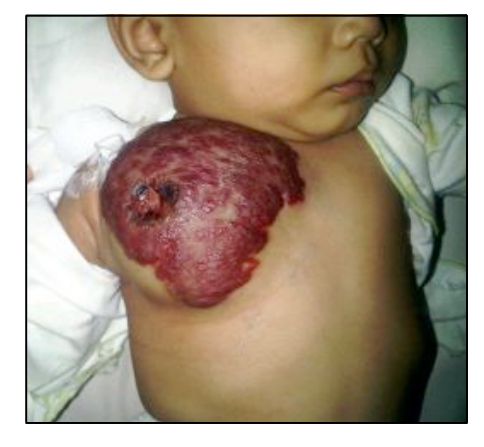
Figure 1 . Oblique preoperative view The mass have definite margin, smooth surface, mostly are reddish colour but some part mainly at the center, have purplish appearance. Post ulcer and bleeding at the

Blood: full blood count and urea &electrolytes, coagulation profile was normal. Computerized Tomography (CT) Scan were reported normal apart from the soft tissue mass on the right side of the chest and suspected as hemangioma.